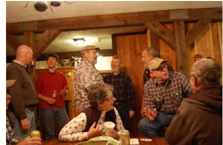
The first-ever Forest Fest Indoor Potluck Picnic held Nov. 8, 2014 at Woodland Lodge was a rousing success bringing together dozens of forest lovers to share good food, good music and a commitment to sustainable forestry and protection of forested land.