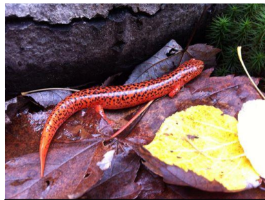
October in the Foundation's Blooming Valley Forest