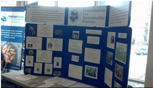
Tabling, speaking and educational programs were numerous in 2014.